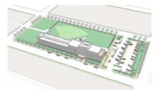
PHASE 1 - 150 STUDENTS