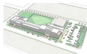
PHASE 3 - GROWTH TO 250 STUDENTS