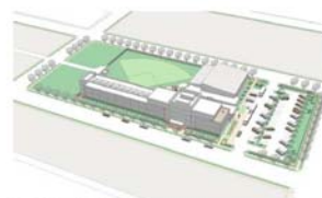
PHASE 2 - POOL & GYM